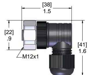
Female Right Angle